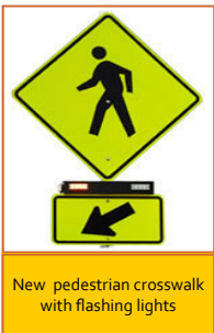
New pedestrian crosswalk with flashing lights